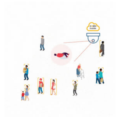
Protect (Edge-to-Cloud) Face, body, and behavior alerting